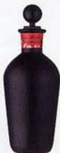
ANTHOUSA HOME AMBIANCE PERFUME IN WARM AMBER AND CEDARWOOD, $72, ESSENZA, 206-547-4895

Banish winter blahs with Anthousa's newest line of home fragrances. Packaged in gorgeous, Asian-inspired bottles, they come in scents like Warm Amber and Cedarwood. Available at Essenza (615 N. 35th St., 206-547-4895).