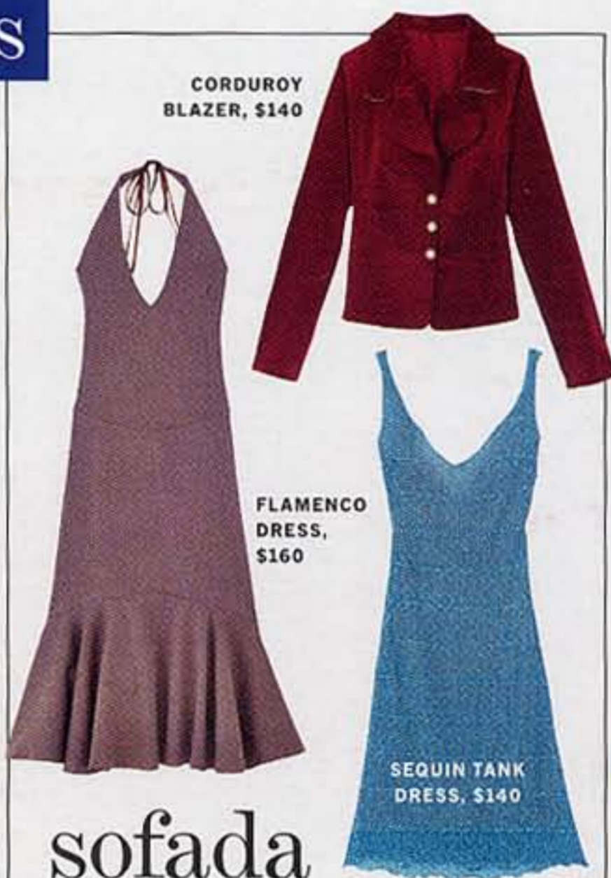
CORDUROY BLAZER, $140

Davora Lindner and Camilla Eckersley live in Seattle, but they haven't forgotten the Nebraska plains where they grew up. "It might sound odd, but we often think of pioneering women when we design," says Eckersley. "We want to make feminine clothes that are still really practical." The duo's designs feature body-hugging shapes with utilitarian details. Prices, $52 to $200. Available at Olivine Atelier (5344 Ballard Ave. NW, 206-706-4188) and Zebraclub (1901 First Ave., 206-448-7452).