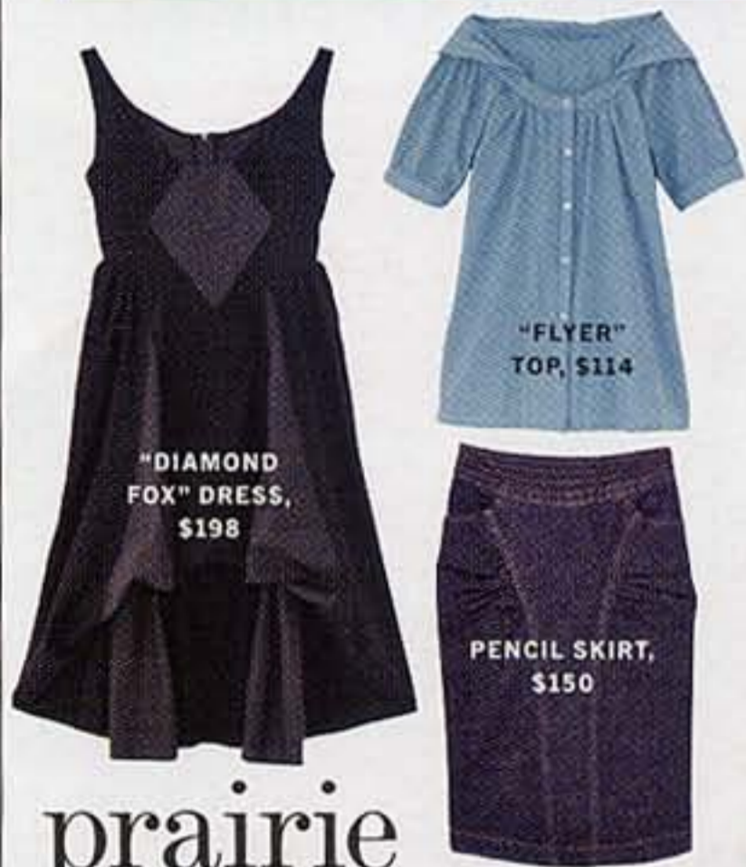
"DIAMOND FOX" DRESS, $198