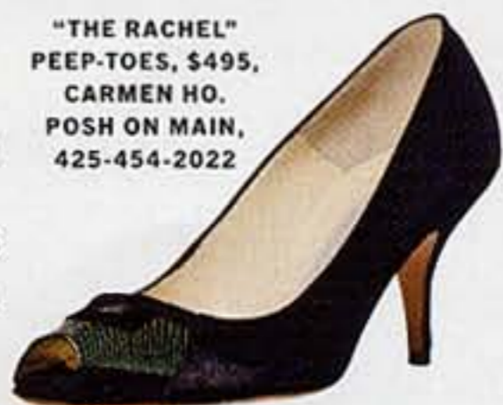
"THE RACHEL" PEEP-TOES, $495, CARMEN HO. POSH ON MAIN, 425-454-2022

Recently opened shoe salon Posh on Main (10245 Main St., Bellevue, 425-454-2022) is quickly earning a reputation for its slate of gorgeous lines, like Tory Burch and Loeffler Randall. It also has a Seattle exclusive on Carmen Ho.